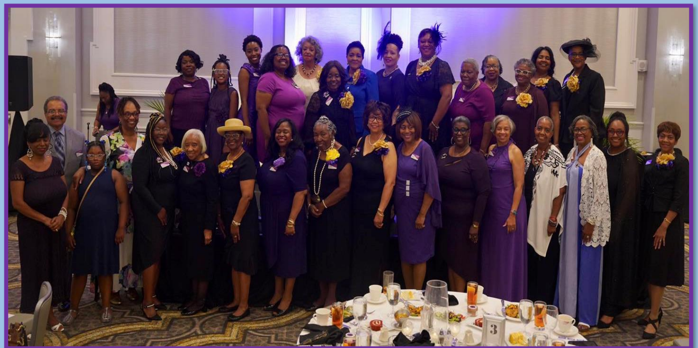
NCNW members in attendance photo