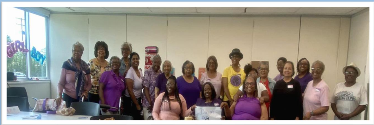
Group photo of members in attendance