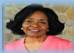
NCNW, Inc. Columbus Section Columbus, Ohio